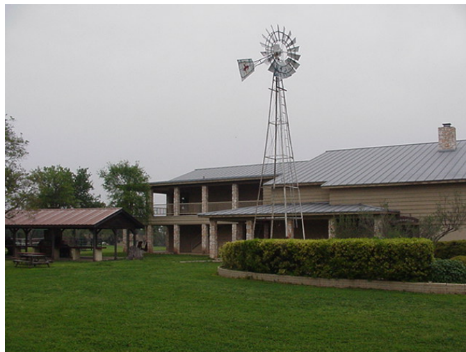
MAIN HOUSE LAWN